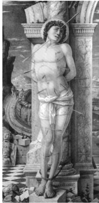
St. Sebastian by Andrea Mantegna, c. 1459, Vienna, Kunsthistorisches Museum