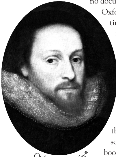
Oxford in his forties*

Southampton, born in 1573, turned seventeen in 1590, an appropriate age for the Fair Youth. He was considered “fair” as is the “lovely boy” of the Sonnets . He was a nobleman, as they imply. The Sonnets inform us that the youth’s father was dead (“you had a Father, let your Son say so”) (13, 14), while his mother was living (3) as were Southampton’s parents. Most significant is the fact that, at this same time, Southampton’s guardian, Lord Burghley, was pressuring him to marry, a theme reflected in the first seventeen sonnets, the so-called Marriage Sonnets . Although there is no document directly connecting Oxford and Southampton, the fact that it was