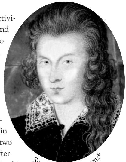
Southampton in his teens*