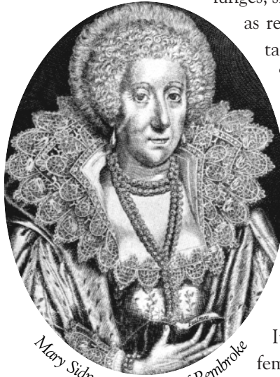
Mary Sidney, Countess of Pembroke

The significant term here is “concrete.” Webster compacts, sometimes to the point where the meaning is endangered, because in an effort to scan while keeping the word count as low as possible he will leave out articles, prepositions, even verbs. His speeches are like a series of jabs and lunges, short, sharp and deadly, a style that closely resembles that of Mary Sidney