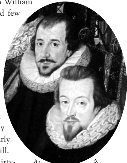
Northampton and Cecil

The disgust this caused was overwhelmed by grief when that November the oldest son of the King and Queen, the nineteen-year-old Prince of Wales, died suddenly (some say of typhoid fever, some say smallpox). Prince Henry had begun to display the moral sense and statesmanship so lacking in his father. The thought that whatever foolishness the King might promote at a given moment could conceivably be mended once the Prince succeeded him had given the