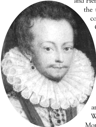
Sir Robert Carr

Although James made peace as best he could among the various Court factions when he took the throne in 1603, his poor management tactics caused endless problems for the functionaries that ran the government. Early on he had allowed Robert Cecil (now Earl of Salisbury) and Henry Howard, (now Earl of Northampton) to maneuver their way into the top offices. Northampton’s nephew Thomas (now Earl of Suffolk) completed the faction that surrounded the King. A third Howard, Charles (Earl of Nottingham), still held the seat on the Privy Council he had been given years earlier by Queen Elizabeth.