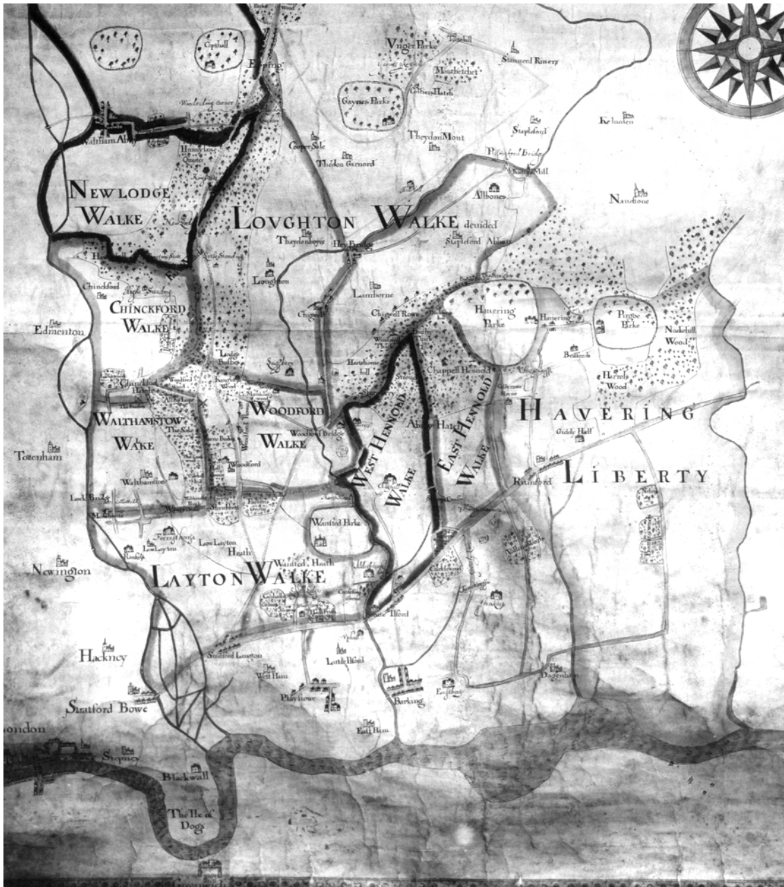
Fig. 1. A near contemporary map of the Forest of Waltham shows the boundaries of the ten Forester's Walks as they were in Oxford's time. The building at the very bottom of the map is Greenwich Palace, on the south bank of the meandering Thames, directly across the river from the Isle of Dogs. Stratford-at-Bowe is just to the north-west, then Hackney a short walk further. The Liberty of Havering is the largest "Walk," on the right. Havering Park is in its northwest corner, almost the center of the map, with Pirgo Park to its right. The palace of Havering-atte-Bowre is at the eastern edge of the Park. Just west of Havering Park is "Chappell Henmold" (Chapel Hainault), at the center of an area more thickly covered with trees than most of the map. The largest area still thickly forested, running south to north near the western edge of the Forest, remains today as the Forest of Epping. Theydon Mount (aka Hill Hall), home of Oxford's tutor, Sir Thomas Smith, lies to the north in the center of Loughton Walk. Gidea Hall ("Giddy Hall"), childhood home of the Cooke sisters, is just under the V of "Havering." "Playstowe" is towards the bottom of "Layton Walke." (Used with permission of the ERO.)